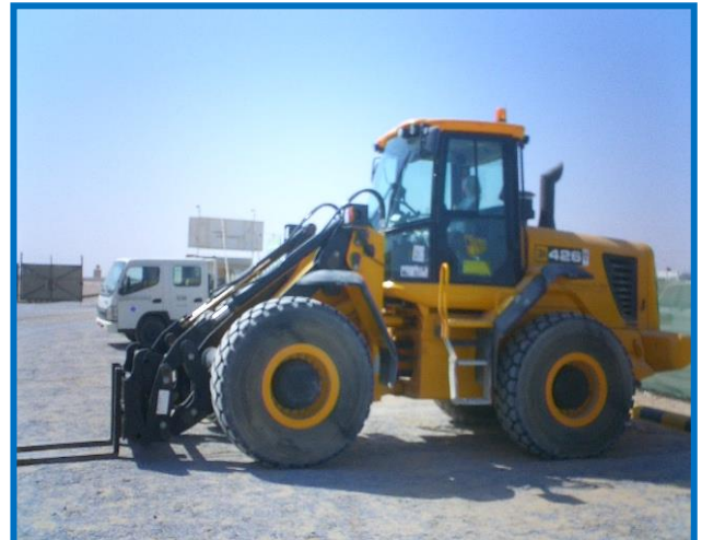
5 Ton JCB Tool Carrier .....At Site