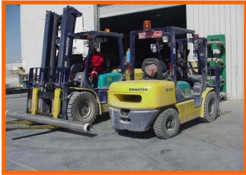
Forklifts.....3 Ton, 5 Ton on Job at Site