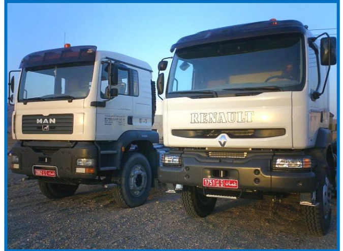
Heavy Vehicles.....Prime Movers (Man, Renault, Nissan Etc.)