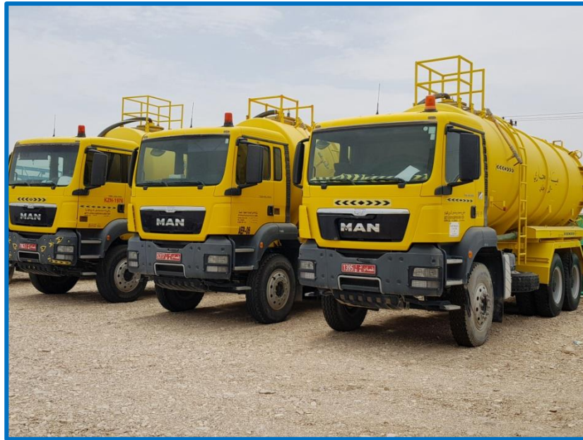
Vacuum Tanker 4500 Gallon (For Sewage waste Disposal)