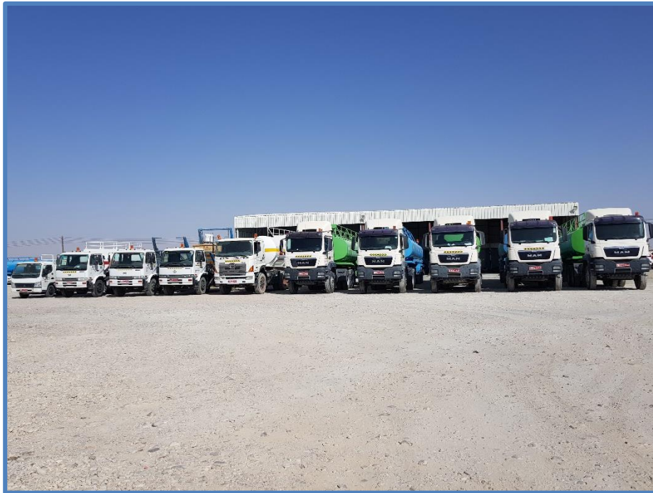
Workshop Facility at Nahada