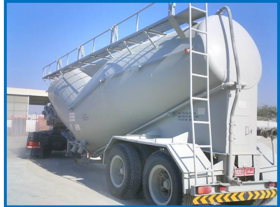
Cement Bulker.....40 Cubic Meter Capacity