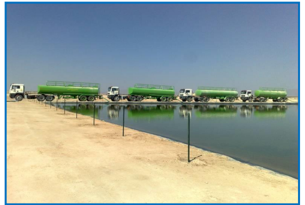
BRINE TANKERS – 8000 Gallon .....at Site