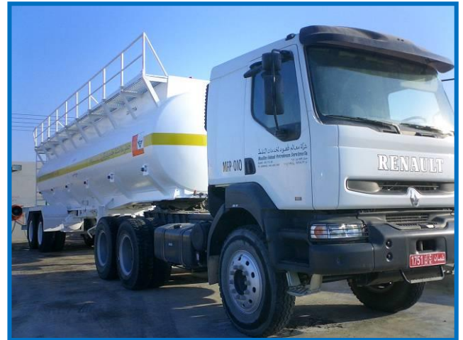
Acid Tankers with Prime Mover 30MT, 26000 ltr.....at site