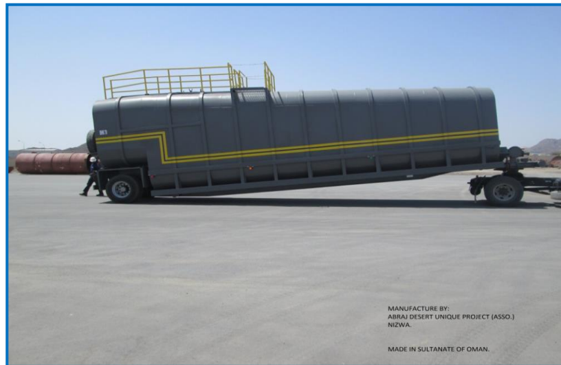
FRAC Tank 500BBL Capacity