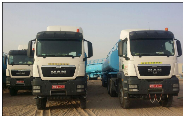
Water Tankers 8000 Gallon with Prime Movers at site.....!