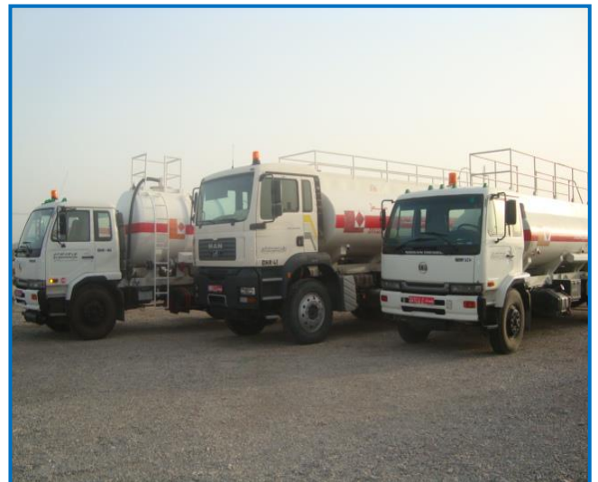
Fuel Tankers.....36000, 20000, 10000 & 3000 Ltr Capacity